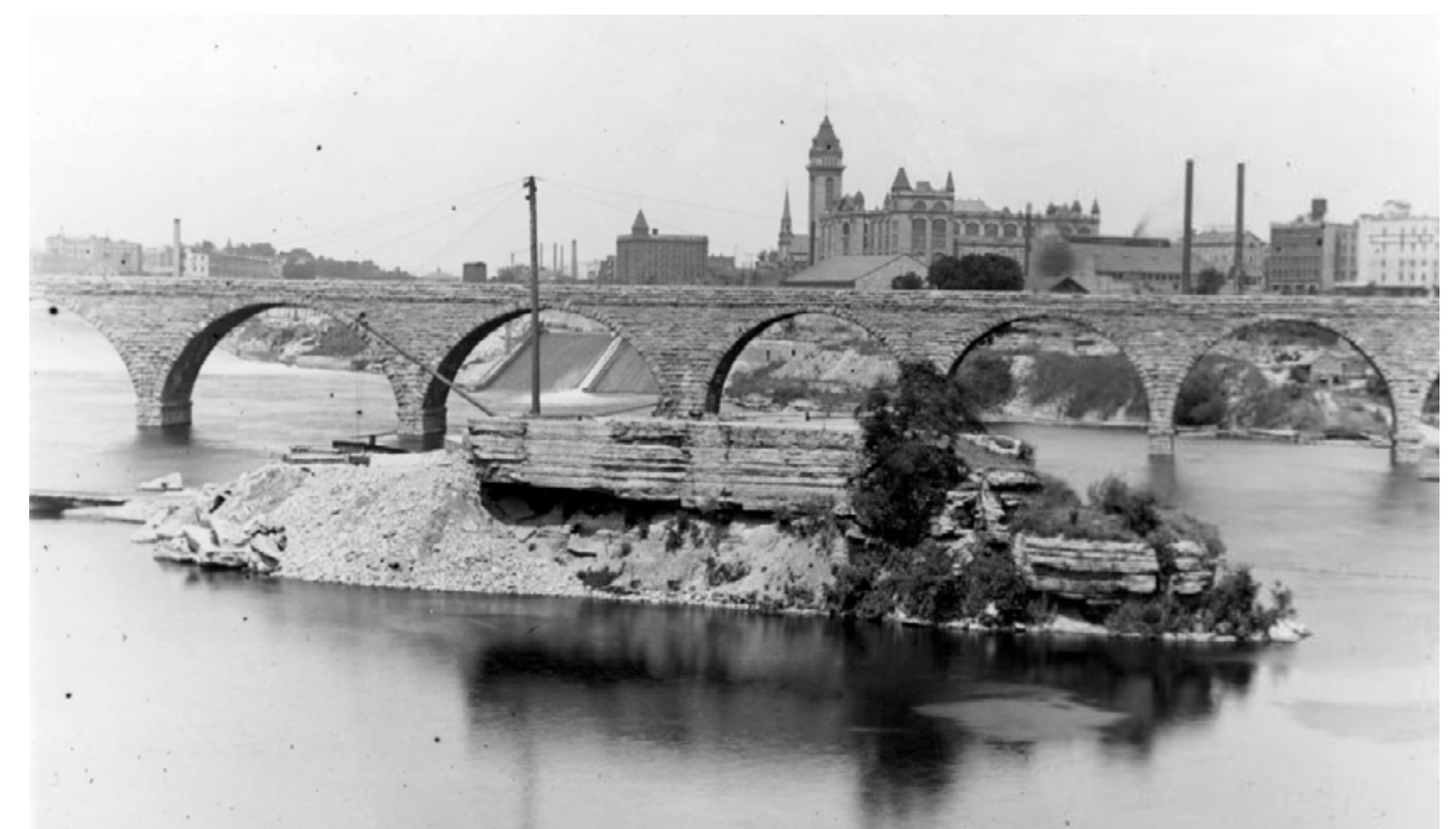
Wita Wanagi (Spirit Island) is a spiritual place where Dakota women gave birth to generations of children. The island was demolished by the U.S Army Corps of Engineers in 1960 to dredge the site for boat passage.